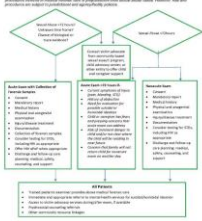
Appendix 7. Care Algorithm