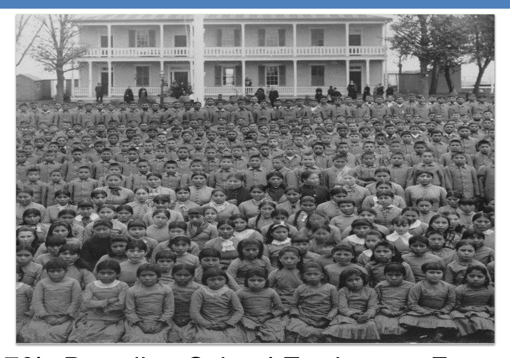
1870's Boarding School Era began: Forced removal of children